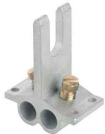
Type 3 Clamp Fitting For 95 mm 2