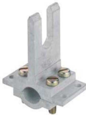
Type 2 Clamp Fitting For 185mm 2