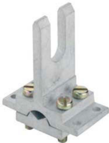
Type 1 Clamp Fitting For 35mm 2 to 120mm 2